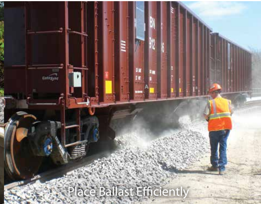
Place Ballast Efficiently