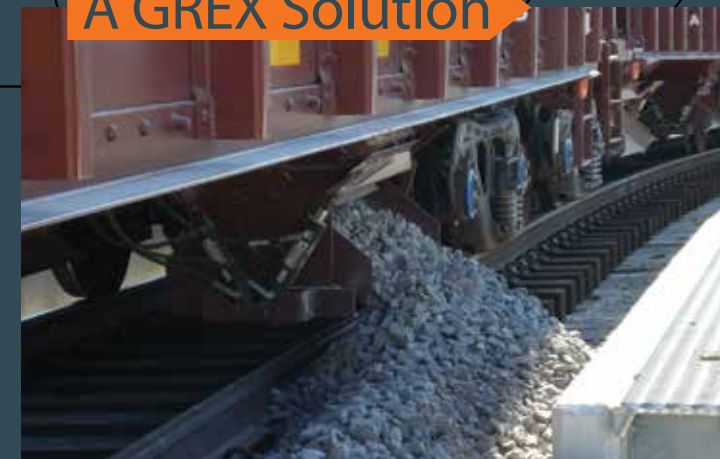
Synchronized Gate System