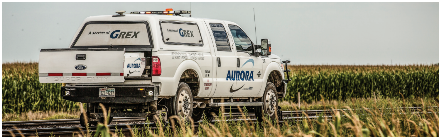
The lowa Interstate Railroad used the GREX Aurora® tie inspection system to evaluate the tie condition of more than 120 miles of track.

A partnership between Georgetown Rail Equipment and the Iowa Interstate Railroad showed the extensive crosstie inspection capabilities of the Aurora system.